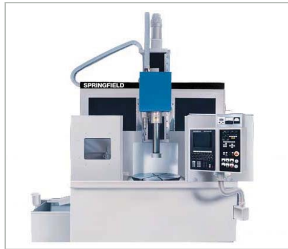
Machine with Standard Guarding