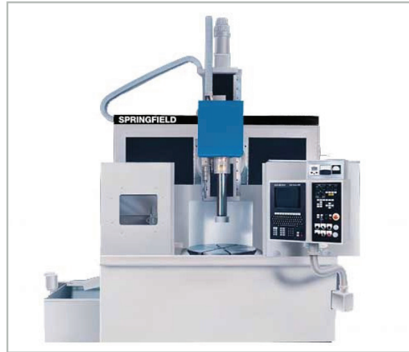
Machine with Standard Guarding