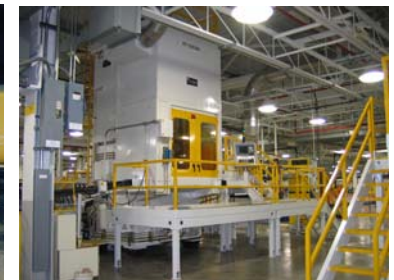
Helical VRT Broach