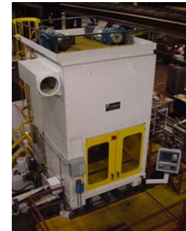
Helical Vertical Rising Table