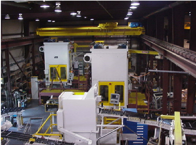
Blue Steel Gravity Conveyance