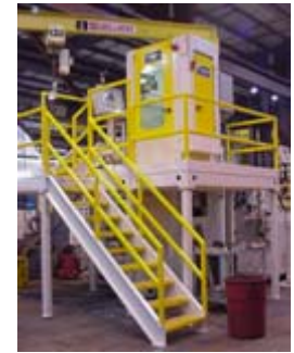
Vertical Push Up Broach