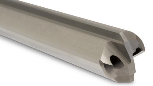
Two-Flute Two-Hole Side View (top) Top View (bottom)