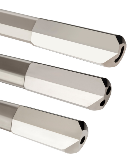
Coolant Hole Styles: Kidney Shaped Hole (top), Dual Hole Configuration (middle), Single Hole (bottom)