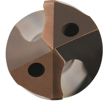
Top View (above), Twist Drill side view (bottom)