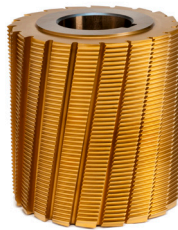
TiN Coated Rack Cutter