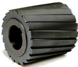
Alcrona Pro Coated Rack Cutter